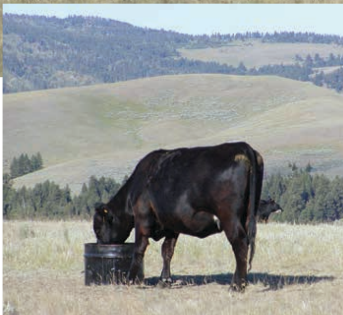
► Placing LMB in spots that cattle are able to access but typically are not already grazing will help extend the grazing season and allow cattle to better utilize available forage.

explained. For larger herds that require more than two barrels of supplement, Bailey suggests keeping with the pair idea, but spacing the pairs 200-300 yards apart. “With larger herds we still put them in the same spot, we just used more area.