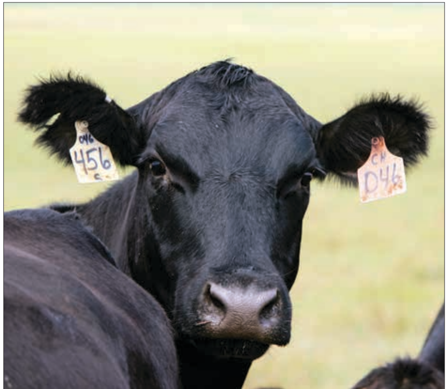
► “Make a cow first, and the carcass will come,” was always the TA Ranch motto.