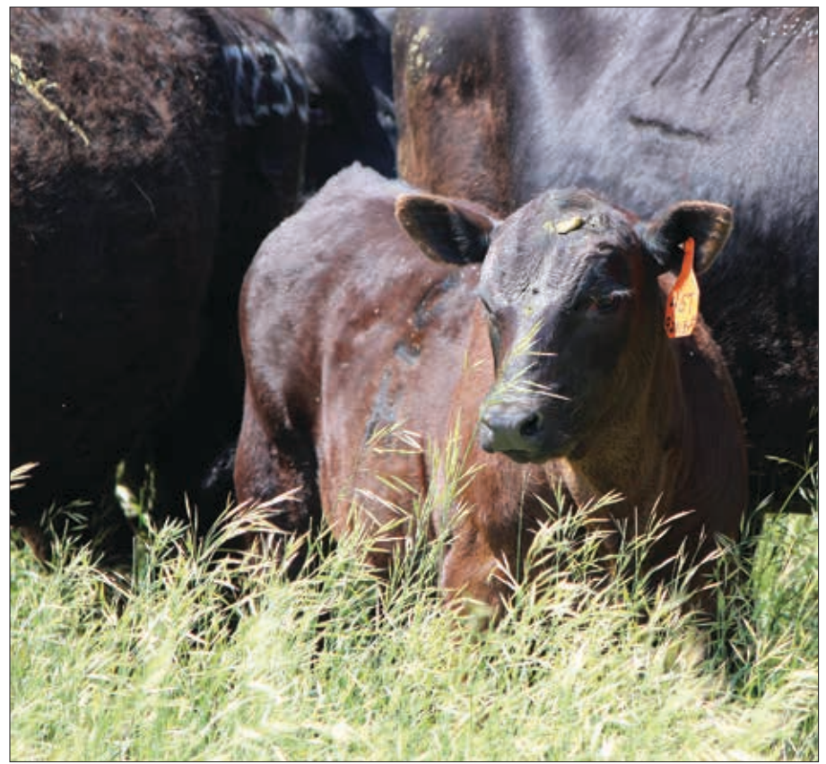
► It would take drawing a family tree to explain how everyone involved with G Bar H Genetics is related, but raising quality Angus bulls is in their genes, a tradition they carry out on the land homesteaded by their ancestors in 1910.

It might be on horseback out in the pasture, around the kitchen table or at their annual bull sale. Wherever it is, this family uses the talents within its own gene pool to produce the best Angus cattle it can and help its customers bring premium beef to the table.