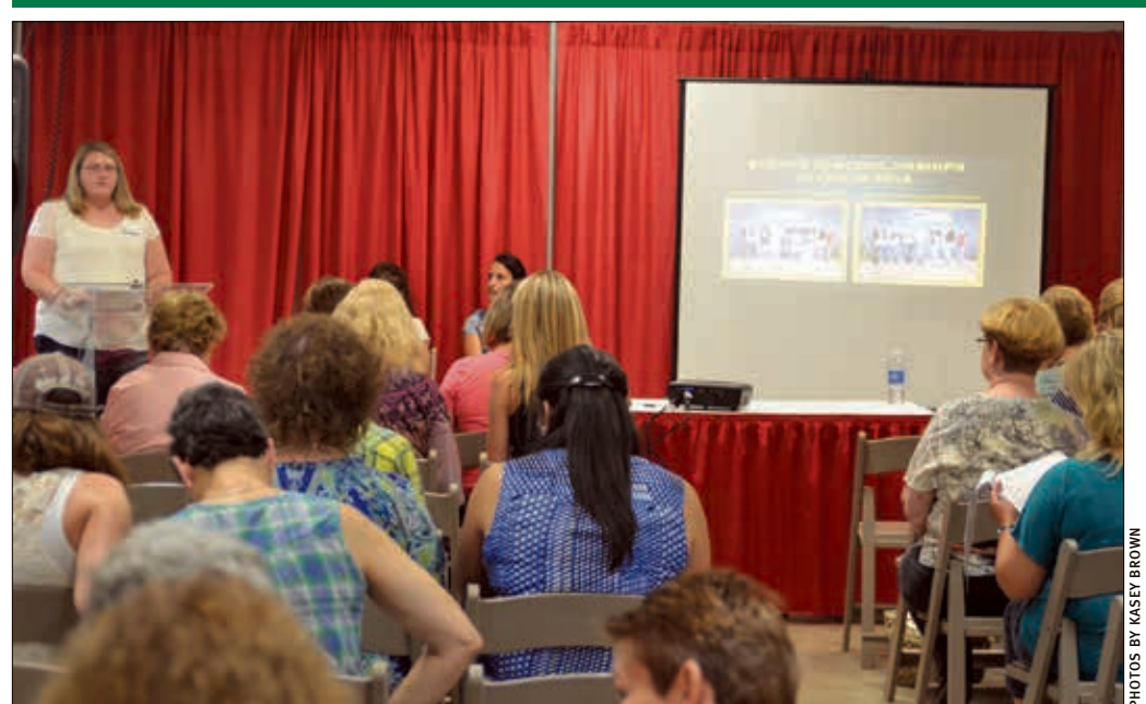
▶ After the workshop and social, the American Angus Auxiliary midyear meeting was conducted.