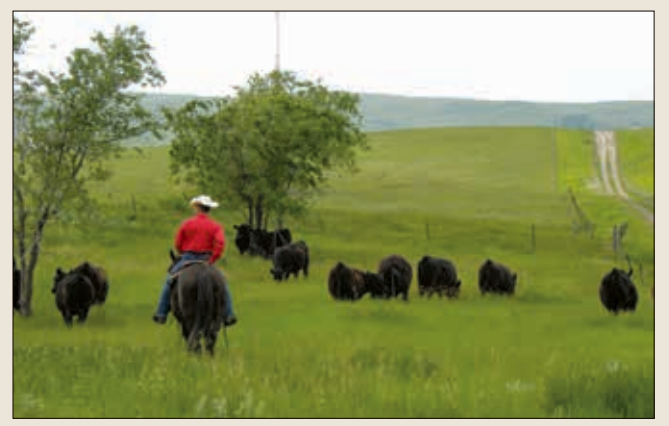
► Ellingsons operate a fairly "ranchy" operation in a region where it takes about 12 acres to support a cow-calf pair. Managed under a rotational grazing system, the cows are expected to graze throughout most of the year, with limited supplemental feed. The latter comes from farming enterprises that include production of hay and a relatively few acres of feedgrains.

This year, Ellingson Angus will calve 550 registered females and about 100 commercial cows. A majority of the cows deliver in the spring, from late February through the end of April. A small group of cows are bred to calve during late-August and September. The fall herd was established as a way to expand production, without increasing the spring work load. Ellingsons also wanted to produce some longer-aged bulls to sell, along with spring-born yearling bulls,